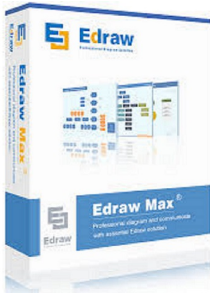
Edraw Max Serial Keygen Cd Key